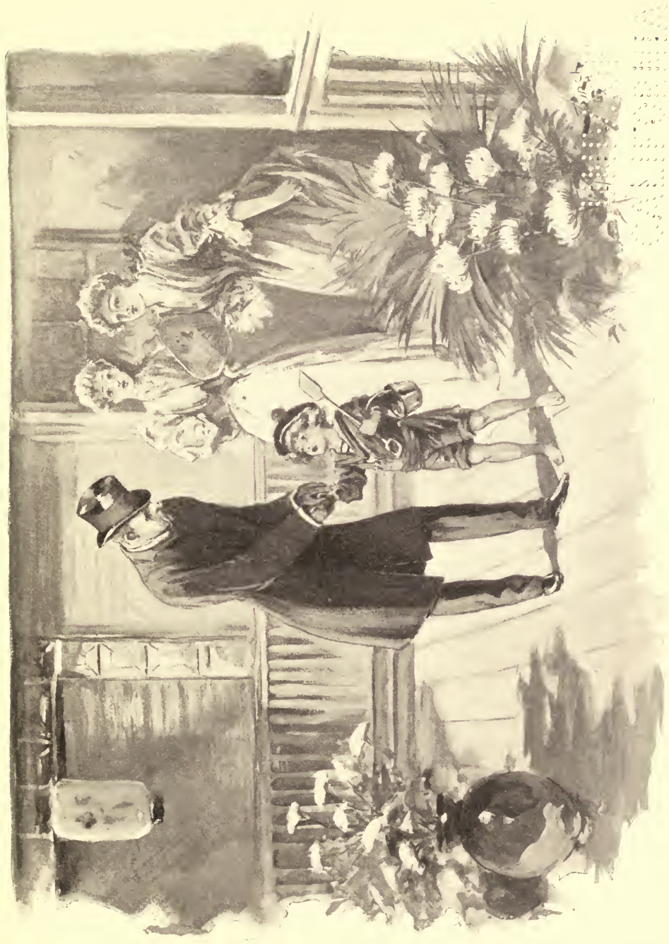
"I'M VERY SORRY FOR YOU, MR. WENHAM, ABOUT YOUR WIFE BEING DEAD."